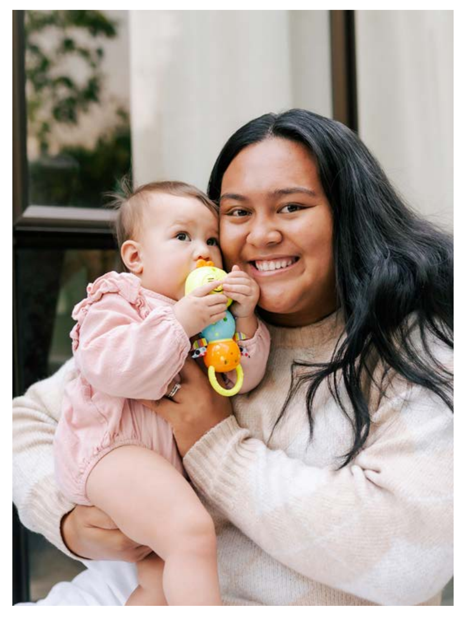
Te Mana Ola Engagement Report