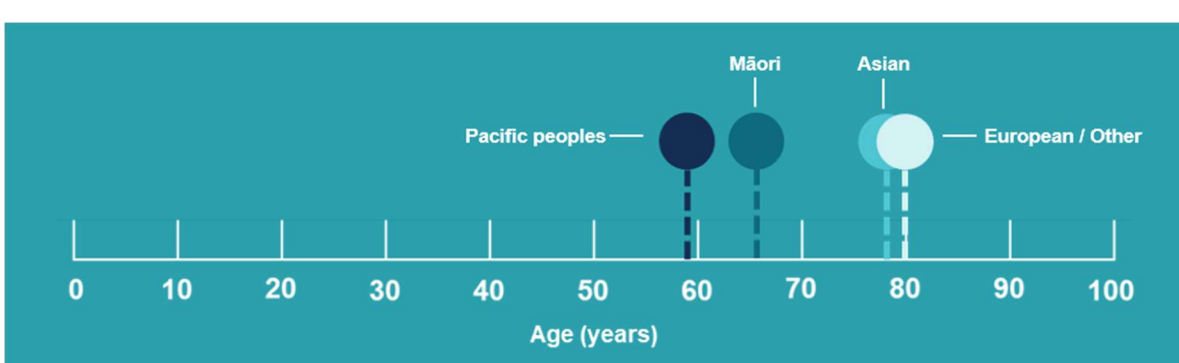
Figure 2: Age in years, in which at least 50% of the population have at least one long term condition, by ethnic group, 2020

In addition to higher mortality, Māori experience higher rates of morbidity, at a younger age, than other ethnic groups. Māori are more than 2 and a half times as likely to experience multiple long-term conditions as European/Other people. The point at which 50% of the population have at least one long-term condition occurs 14 years earlier for Māori (66 years) than European/Other people (80 years)<sup>10</sup> (Ministry of Health 2022c).