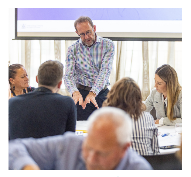
Tātou, Manatū Hauora online engagement platform, is an engagement channel for the health workforce to submit ideas around workforce challenges and opportunities. People could discuss, support and challenge ideas that had been submitted.

Whilst the Tātou health workforce challenge will be closed to further submissions on 30 November 2022, the ideas provided will remain available for viewing.