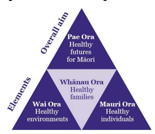
Figure 1: He Korowai Oranga framework

Our vision for healthy urban development is pae ora<sup>2</sup> – healthy futures for all. Pae ora is a holistic concept that includes three interconnected elements: mauri ora (healthy individuals), whānau ora (healthy families) and wai ora (healthy environments) (Figure 1). These three elements are mutually reinforcing and strengthen improvements in health outcomes over time.