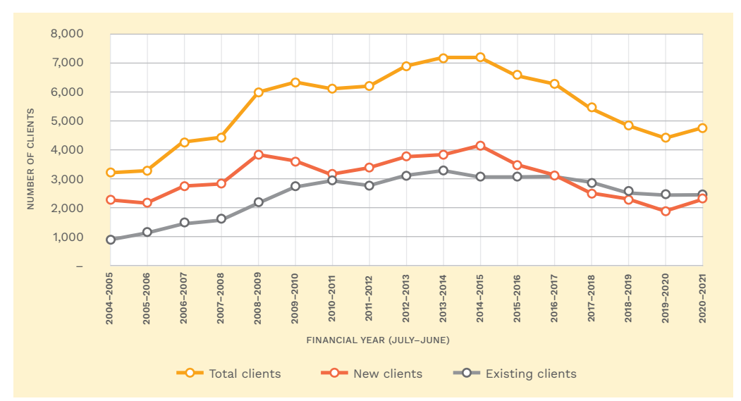
Figure 1: Clients accessing Ministry-funded services (excluding brief interventions)