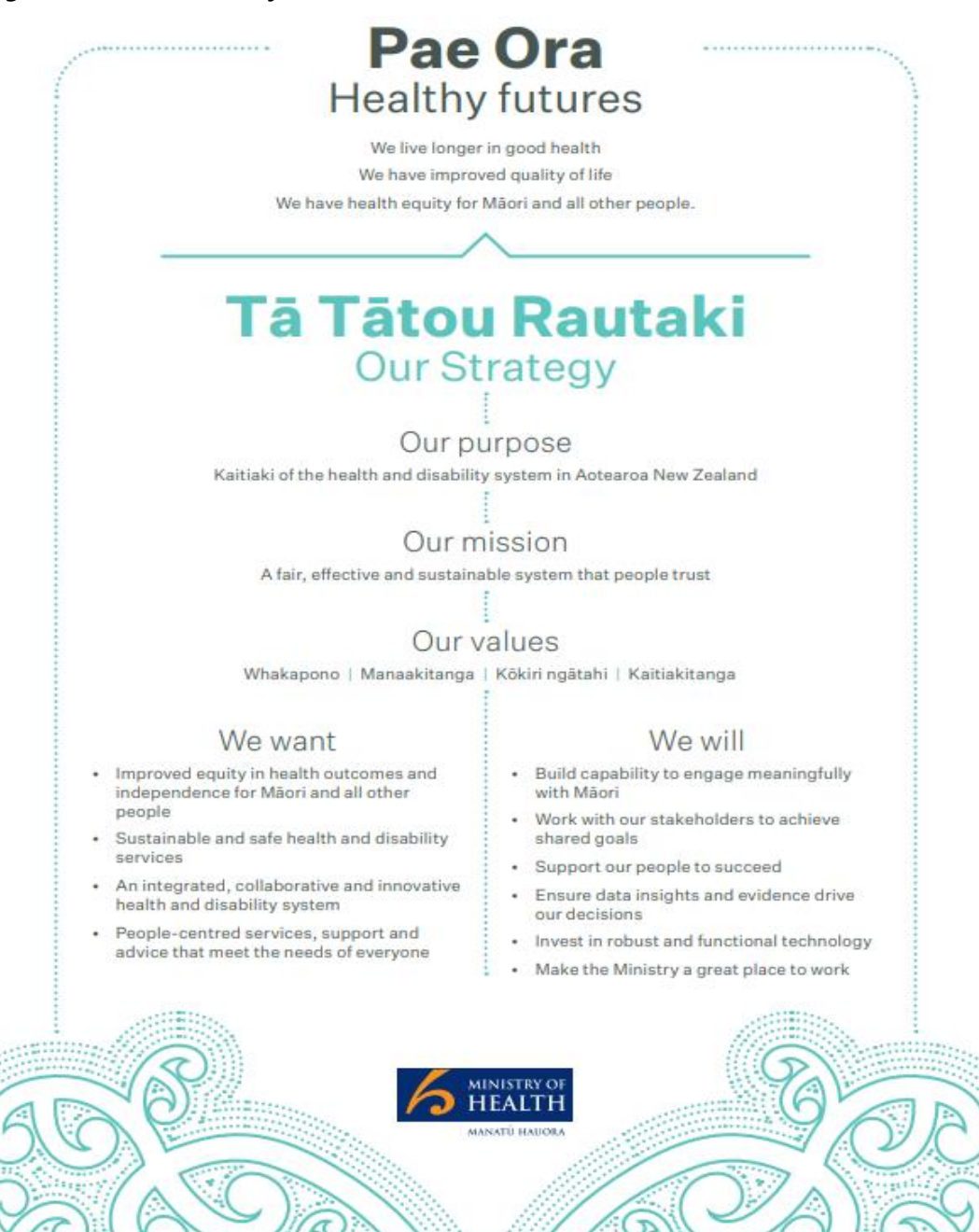
Figure 1: Pae ora: healthy futures