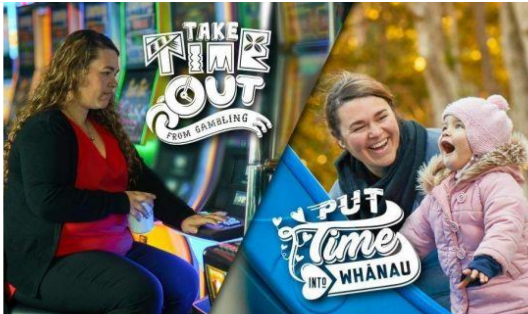
Figure 5. Health promotion imagery reproduced from HPA website (HPA, 2018)

This messaging is concerning in the context of the findings of this study, where gendered responsibility for family (and child) wellbeing, were found to be contextual factors for women’s problematic gambling and harm. The findings of this New Zealand based study are aligned with a body of international research on women’s health issues and gambling (Holdsworth et al., 2012; Morrison & Wilson, 2015; Schull, 2002; Svensson, 2017). The notion of ‘choosing family not pokies’ reinforces powerful cultural and societal narratives which produce women as always-already responsible for familial wellbeing, and the strain this can place on women’s mental and physical health (Dinh et al., 2017; Dolezal & Lyons, 2017; Lively et al., 2010; Schnittker, 2007). This disconnect suggests that a return to earlier HPA (previously Health Sponsorship Council) conceptualisation of community ownership and influence over gambling harm is necessary, e.g. ‘problem gambling: our communities, our families, our problem’ (HSC 2009 cited in P. J. Adams & Rossen, 2012). Action should be re-oriented to the conditions of possibility for gambling practices and harm: “getting society to understand the questions and issues around gambling harm” (HSC 2009 as cited in P. J. Adams & Rossen, 2012, p. 1052). This includes supporting communities to conceptualise the social and political determinants of gambling harm, identify and action potential solutions (Cassidy, 2018; Livingstone et al., 2018).