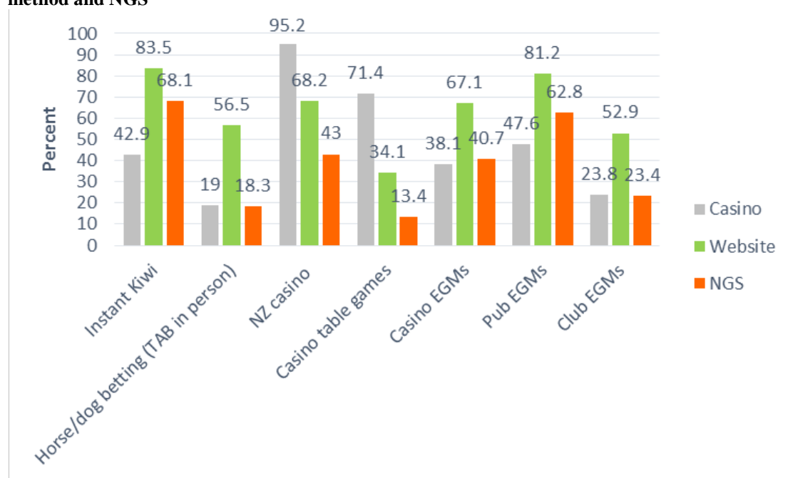
Figure 2: Past year participation in gambling activities for the MR/PG cohort by recruitment method and NGS

There were no other notable differences in past year gambling between the MR/PG cohort and moderate-risk/problem gamblers in the NGS.